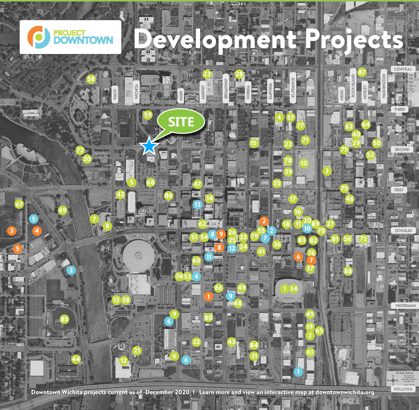
Downtown Wichita projects current as of December 2020 | Learn more and view an interactive map at downtownwichita.org

View the back of this document to see a full list of all projects completed since the adoption of Project Downtown: The Master Plan for Wichita